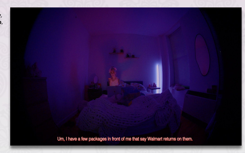
8. Opulence, 2023, HD Film , 35 minutes (Click image to watch trailer)