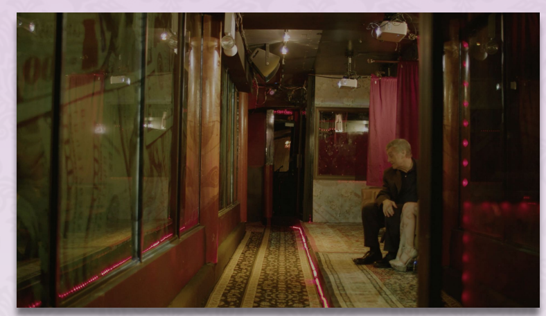
10. Opulence, 2023, HD Film , 35 minutes