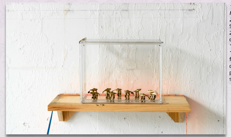
18. Pure Fishing Fishes Fishes, 2023, Sculpture , Size: fish: around 2-3 inches (5cm) container: around 14.17" x 8.66" x 10.63", Materials: fish bait, plastic container, gold paint, plastic doll shoes, LED light