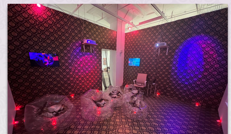
12. Money-Driven FishTank Installation, 2022, Video Game and Video Installation, Size: variable, Materials: wallpaper, fish balloons, plastic bubble chairs, lights