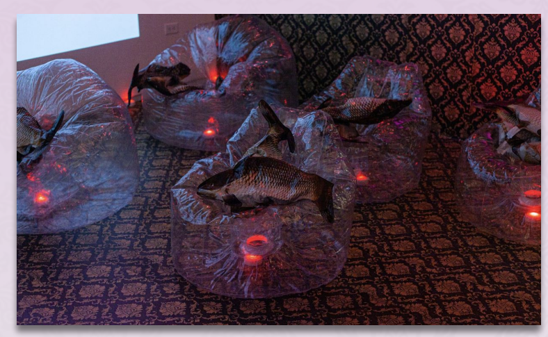
15. Money-Driven FishTank Installation, 2022, Video Game and Video Installation, Size: variable, Materials: wallpaper, fish balloons, plastic bubble chairs, lights