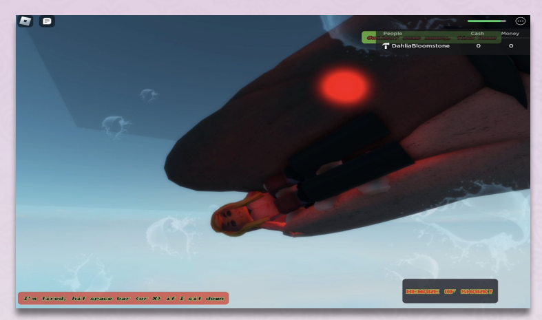
5. Money-Driven FishTank Game, 2023, HD Video Game, Average Play Time: 15 Minutes