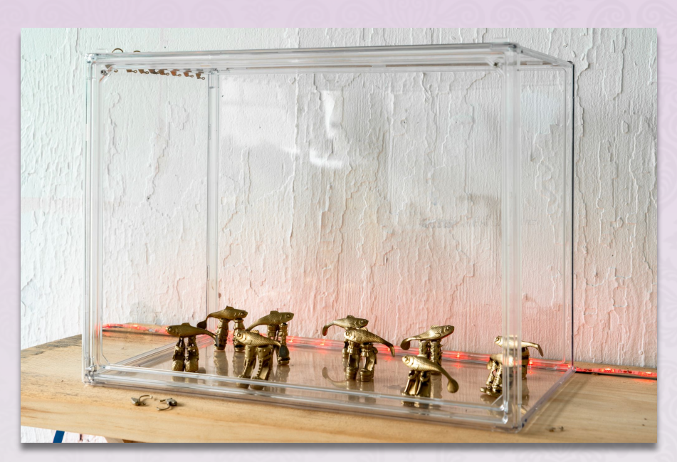
19. Pure Fishing Fishes Fishes, 2023, Sculpture , Size: fish: around 2-3 inches (5cm) container: around 14.17" x 8.66" x 10.63", Materials: fish bait, plastic container, gold paint, plastic doll shoes, LED light