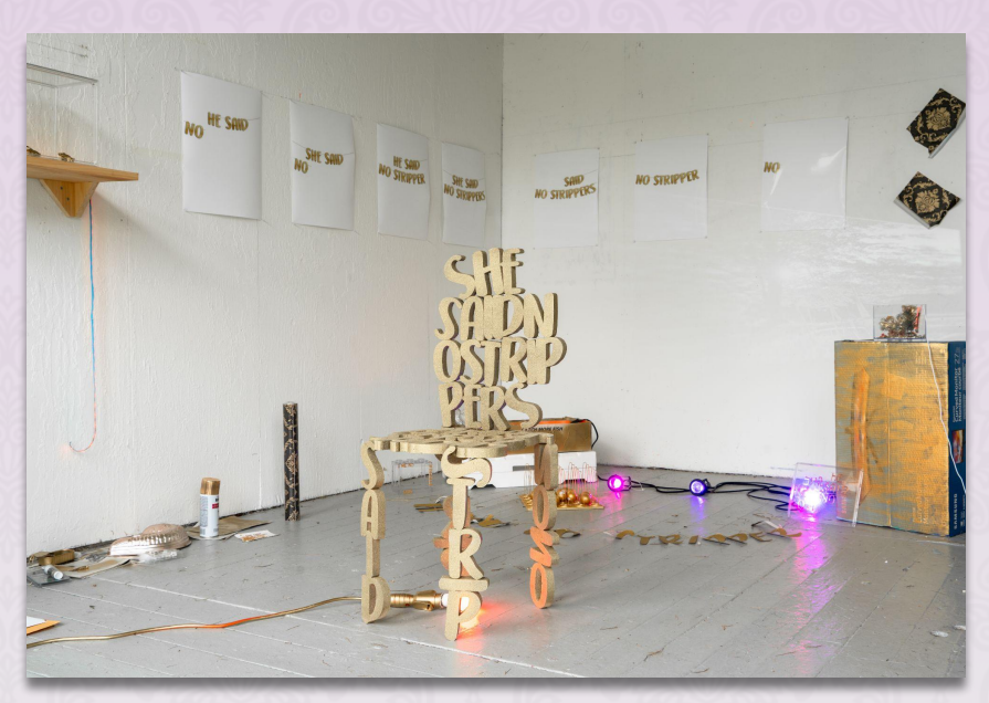
20. She Said No Strippers (Skrippers) Gold Glitter Banner - Bachelor Party Decorations, Ideas, Supplies, Gifts, Jokes and Favors, 2023, Sculpture, Size: Seat Height: Around 18 inches (46 cm) to 20 inches (51 cm), Seat Width: Approximately 16 inches (41 cm) to 20 inches (51 cm), Seat Depth: Typically 16 inches (41 cm) to 18 inches (46 cm), Backrest Height: About 32 inches (81 cm) to 42 inches (107 cm), Materials: wood, gold paint