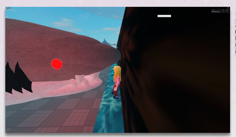
3. Money-Driven FishTank Game, 2023, HD Video Game, Average Play Time: 15 Minutes (Click image to play)