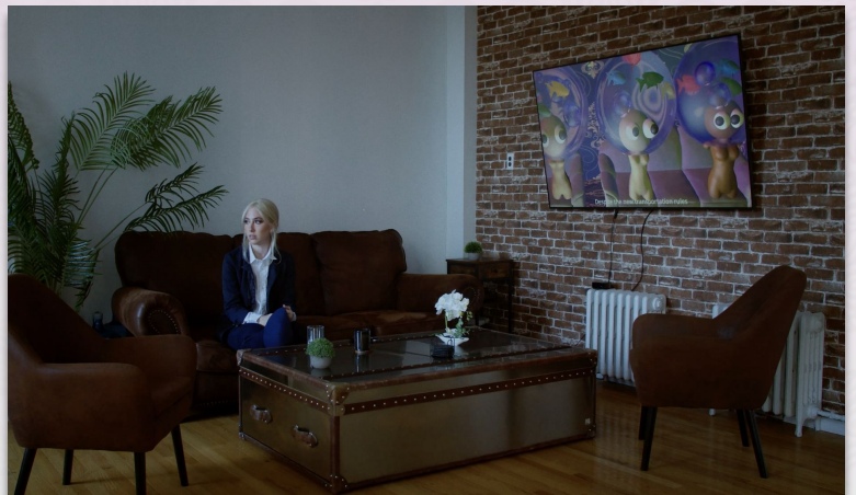
11. Opulence, 2023, HD Film , 35 minutes