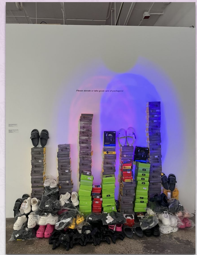
14. Money-Driven FishTank Installation, 2022, Free-to-take objects Installation, Size: variable, Materials: lights, Walmart returns packages, vinyl