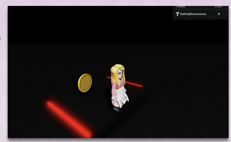
16. Gold Coin Every Time I Make Money, 2023, HD Video Game, Average Play Time: 3 Minutes (Click image to play)