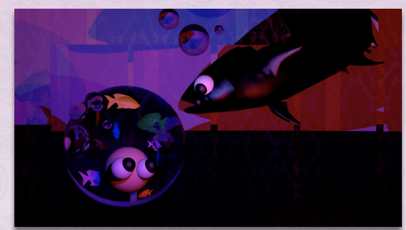
2. Push for Help Episode 6: Welcome Home, 2022, 1080p Video, 16 seconds (Click image to watch)