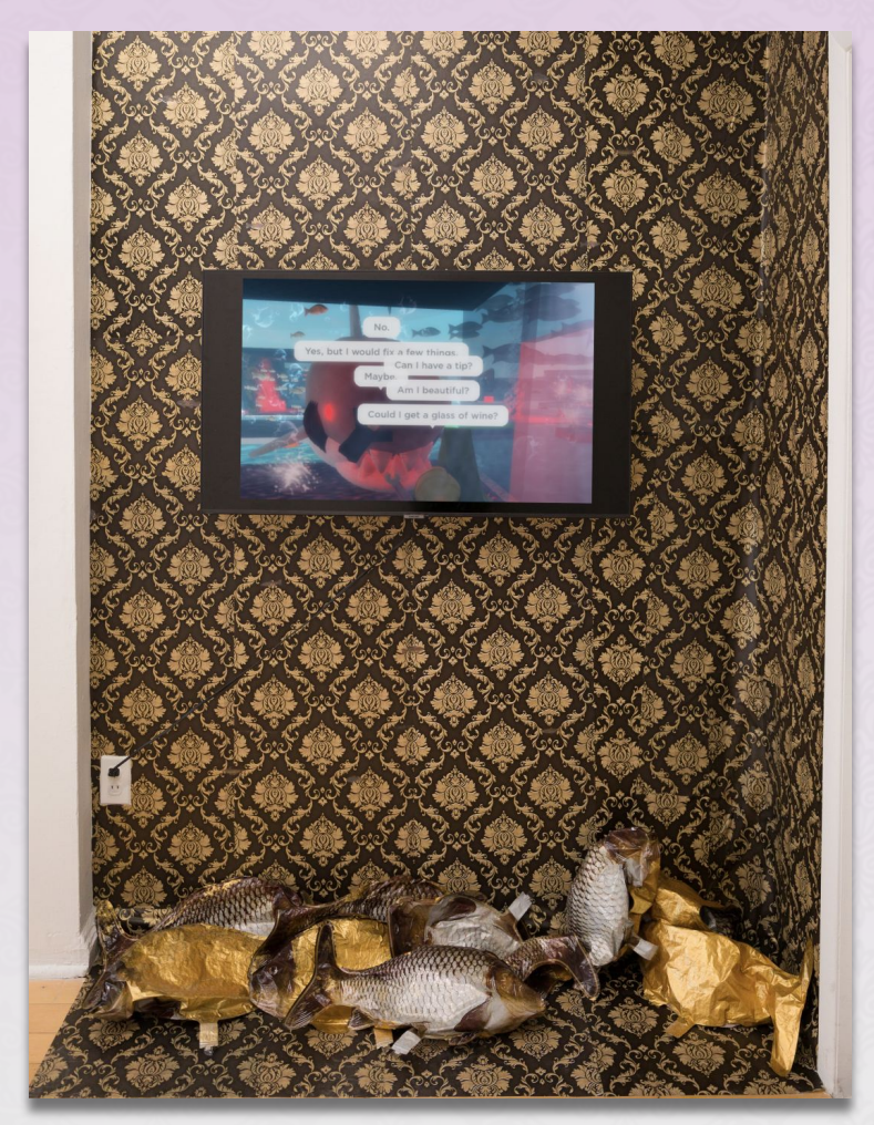
13. Money-Driven FishTank Installation, 2023, Video Game Installation, Size: variable, Materials: wallpaper, painted fish balloons