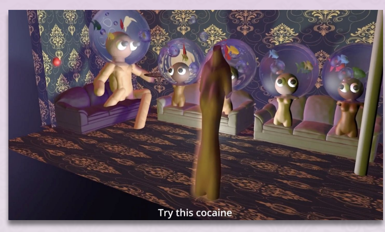
1. Push for Help Episode 1: The Worship of Kitty, 2021, 1080p Video, 3 minutes 6 seconds (Click image to watch)